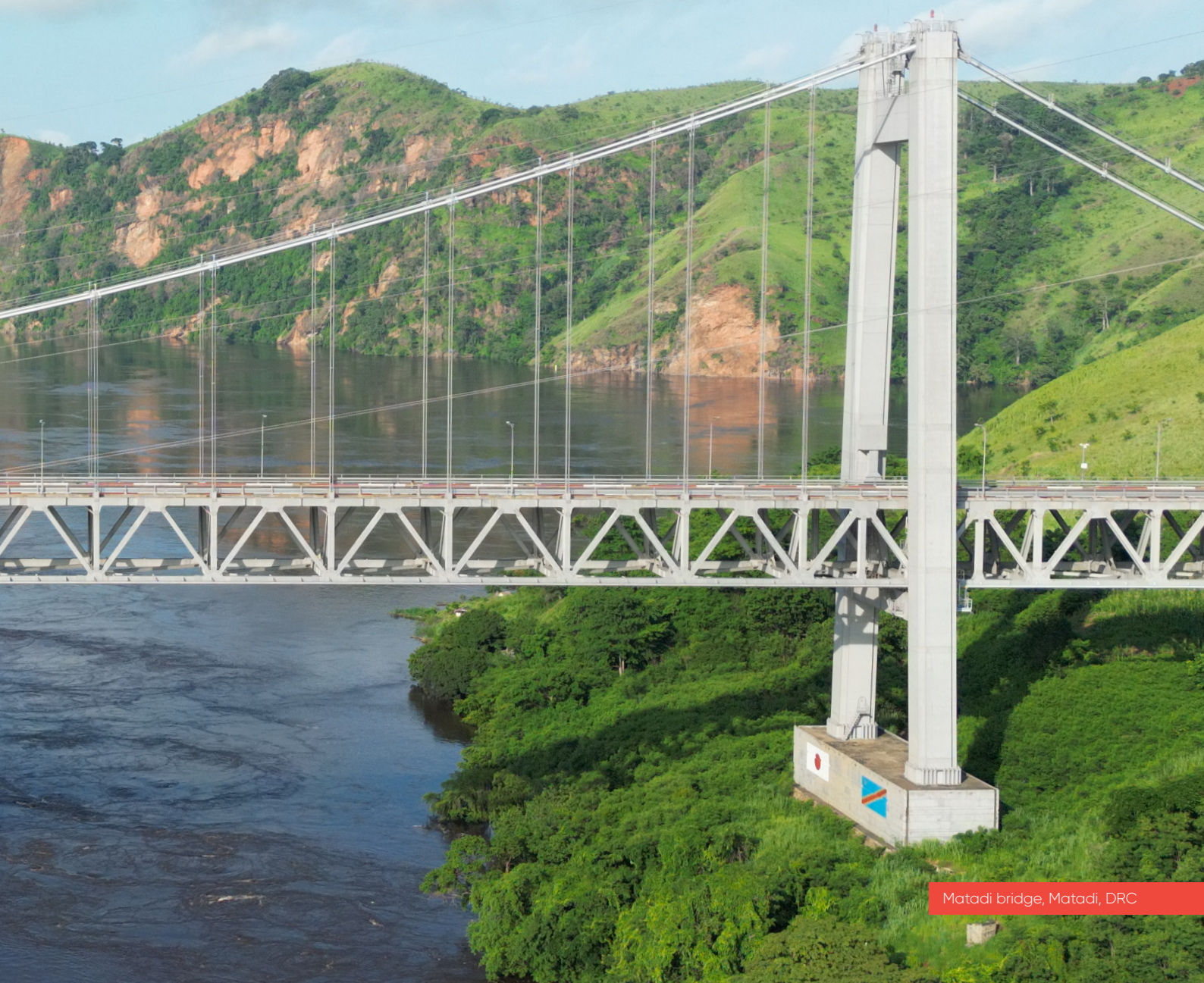
Matadi bridge, Matadi, DRC