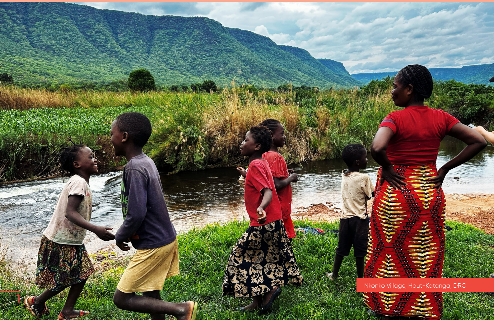
Nkonko Village, Haut-Katanga, DRC

Diamantis & Partners is a law firm based in Kinshasa , Paris and Nouakchott providing expert advice in energy , mining and infrastructure sectors in Europe and emerging markets