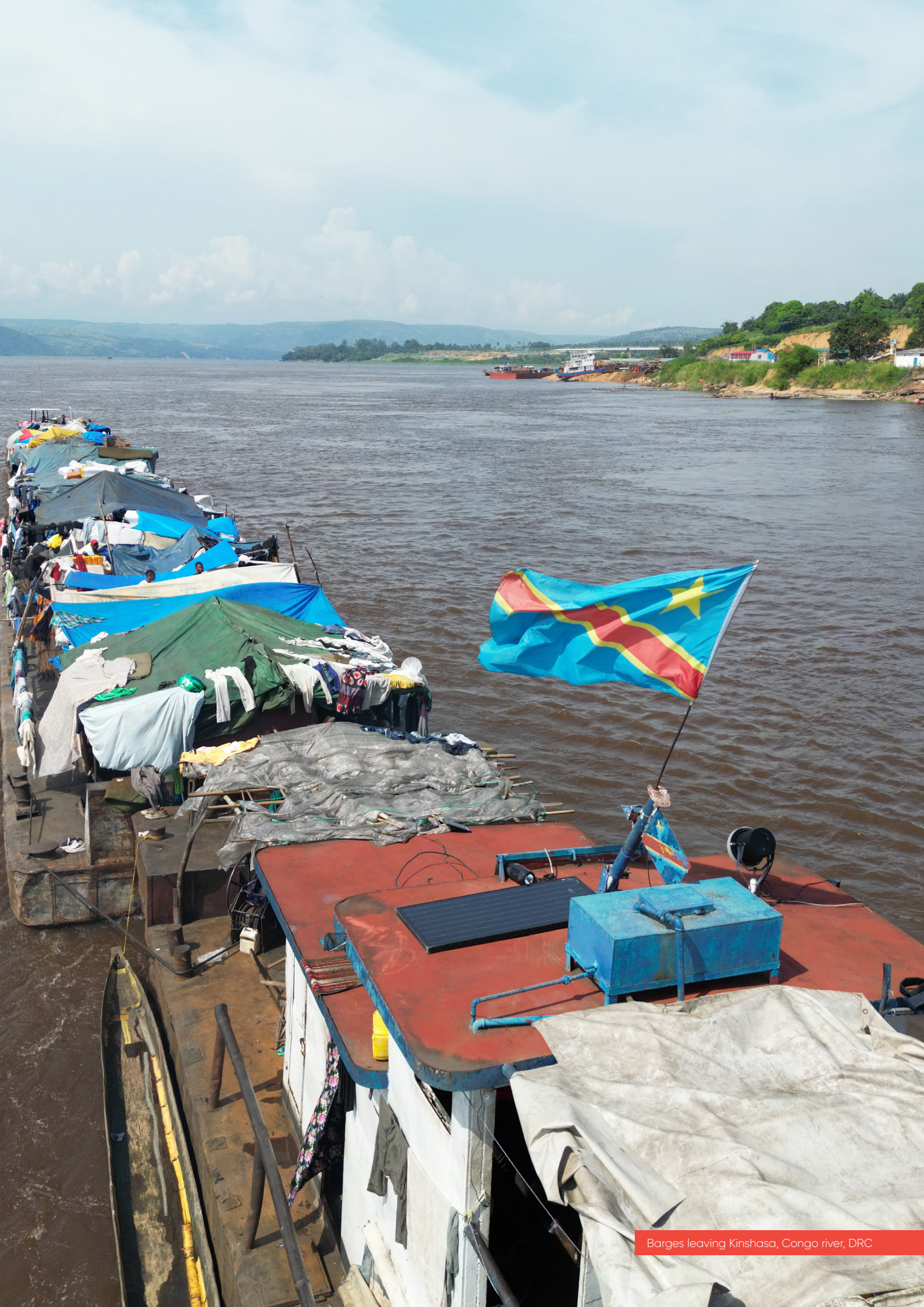
Barges leaving Kinshasa, Congo river, DRC